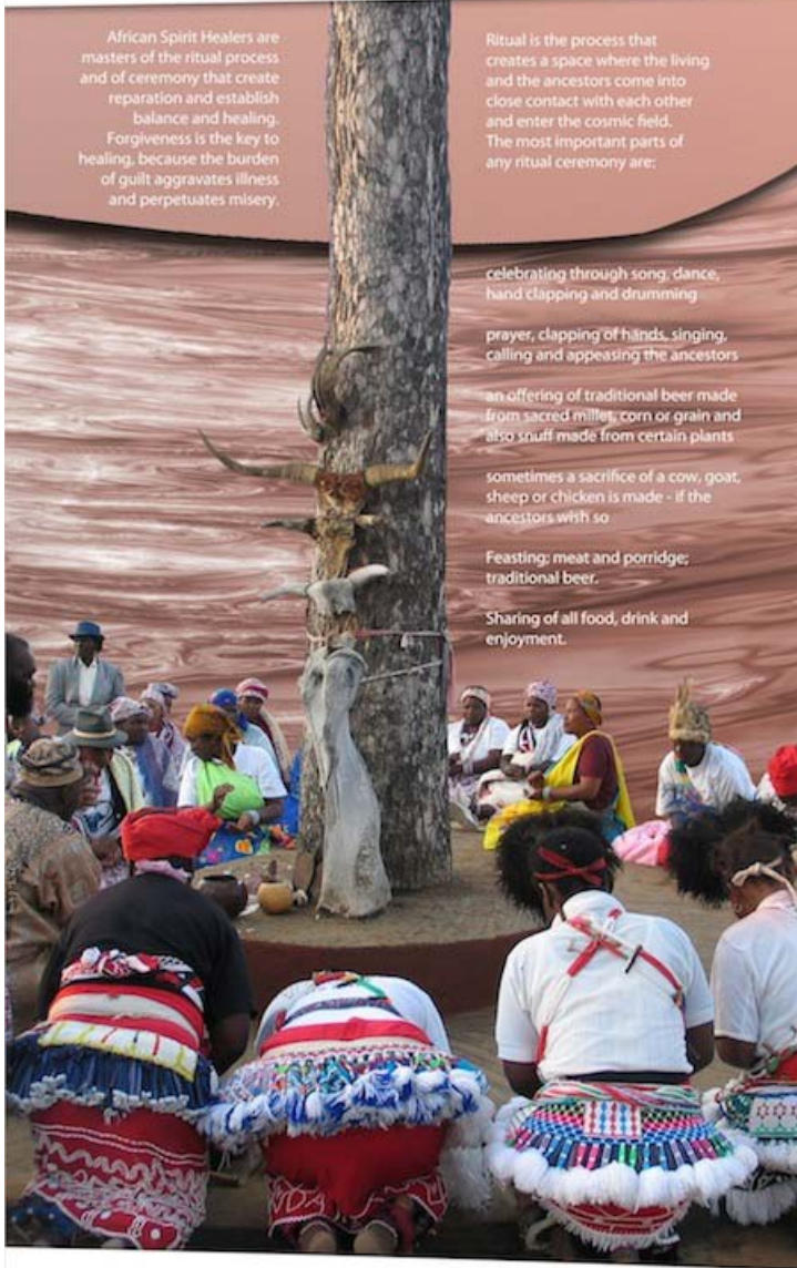
At the Shrine for the Ancestors

Sharing of all food, drink and enjoyment.